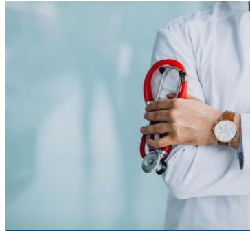
Health Care Facilities